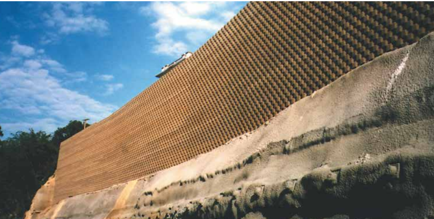
32' High Keystone Wall solves the historic “Natchez Bluff” problem!