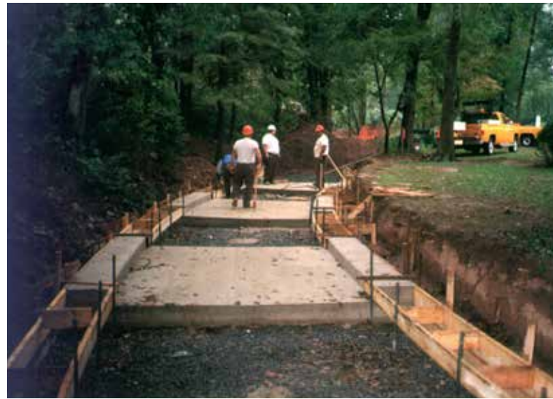
The Keystone units were placed on a concrete footing.

For more information on the Keystone Compac units or other innovative Keystone products, please call 800-747-8971 or visit www.keystonewalls.com .