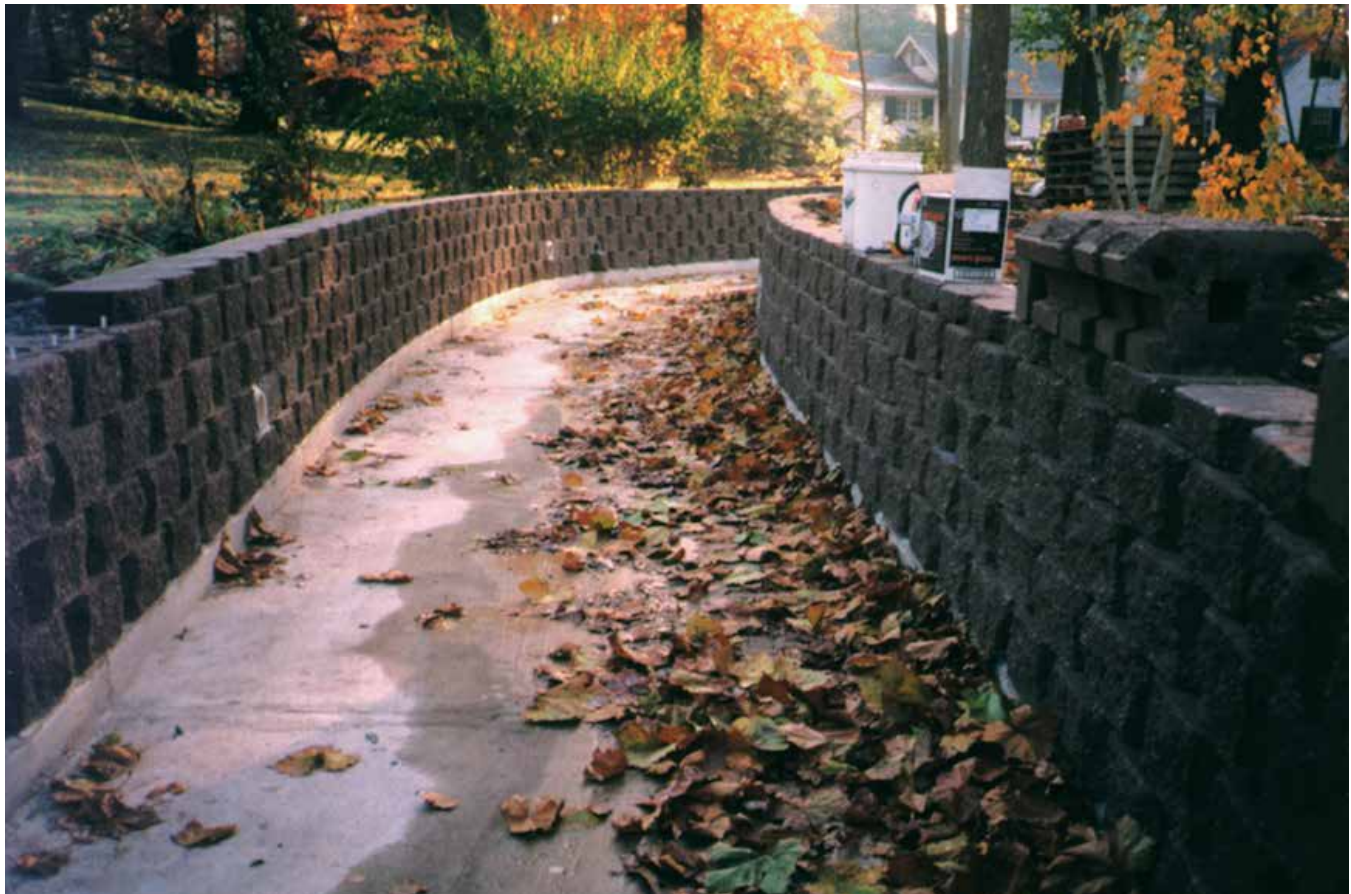
Keystone was chosen for this project by the City of Manassas, Virginia.