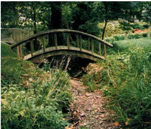
Before project began.