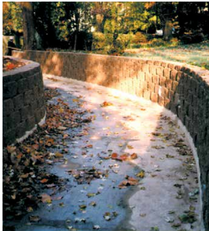
After the drainage ditch improvement project.