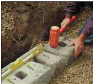
2. Install the Base Course

Once the pins have been installed, provide 1/2" - 3/4" (10 - 20mm) crushed stone drainage fill behind the units to a minimum depth of 12" (300mm). Fill open spaces between units and open cavities/cores with the same drainage material. Proceed to place backfill in maximum 6" (150mm) layers (lifts) and compact to 95% Standard Proctor with the appropriate compaction equipment. Do not use heavy ride-on compaction equipment within 3' (1m) from back of wall. Do not use jumping or ramming type compaction.