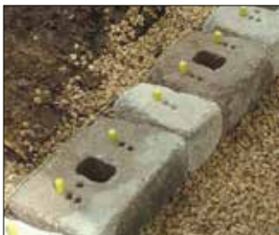
3. Insert Fiberglass Pins

Place the next course of units over the fiberglass pins, fitting the pins into the long receiving channel recess of the units above (Note: Some removal of debris in the pin holes and channel may be necessary prior to placement). Push the units toward the face of the wall until they make full contact with the pins. If pins do not connect with channel but align in open core of upper unit, place drainage fill in core to provide unit interlock with pin. For near vertical alignment, center the unit above over the center placed pins below.