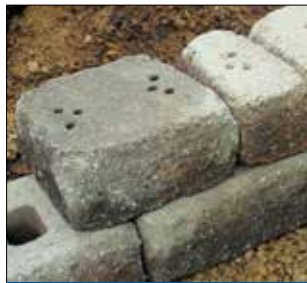
5. Install Additional Courses

Place the first course of units end to end (with front corners touching) on the prepared base. The long groove (receiving channel) on the unit should be placed down and the three pin holes should face up, as shown. Make sure each unit is level - side to side and front to back. Leveling the first course is critical for accurate and acceptable results. For alignment of straight walls, use a string line aligned on the unit pin holes for accuracy. Minimum embedment of base course is 6" below grade.