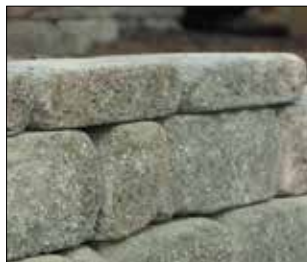
6. Capping the Wall

Place the shouldered fiberglass pins into the holes of the Units (note: place one pin only per each grouping of three holes). Place pins in the middle hole for near vertical alignment or the holes nearest the embankment for a 9.5° +/- setback per course. According to wall requirements and design, the front pin hole (towards the face of the wall) can be used randomly to allow a forward projection of a specific unit for accent and variation in the wall appearance.