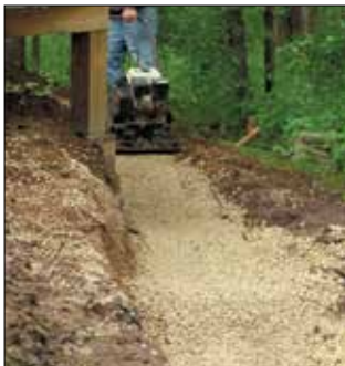
1. Prepare Base Leveling Pad

Remove all surface vegetation and debris. Do not use this material as backfill. After selecting the location and length of the wall, excavate the base trench to the designed width and depth (min. 20" w x 12" d) [500mm x 300mm]. Start the leveling pad at the lowest elevation along wall alignment. Step up in 6" (150mm) increments with the base as required at elevation changes in the foundation. Level the prepared base with 6" (150mm) of well-compacted granular fill (gravel, road base, or 1/2" to 3/4" [10 - 20 mm] crushed stone). Compact to 95% Standard Proctor or greater. Do not use PEA GRAVEL or SAND for leveling pad.