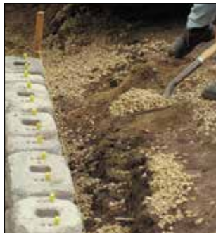
4. Install Fill & Compaction

Remove all surface vegetation and debris. Do not use this material as backfill. After selecting the location and length of the wall, excavate the base trench to the designed width and depth (min. 20" w x 12" d) [500mm x 300mm]. Start the leveling pad at the lowest elevation along wall alignment. Step up in 6" (150mm) increments with the base as required at elevation changes in the foundation. Level the prepared base with 6" (150mm) of well-compacted granular fill (gravel, road base, or 1/2" to 3/4" [10 - 20 mm] crushed stone). Compact to 95% Standard Proctor or greater. Do not use PEA GRAVEL or SAND for leveling pad.