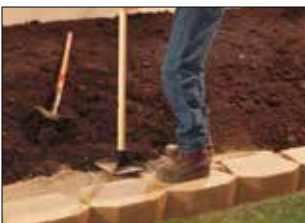
2. Place & Compact Backfill

At wall location, dig shallow trench for wall base (see Typical Legacy Stone Section). Place granular leveling pad material. Compact and level the base pad. Place and level the first course units. If grade changes along base of wall, create stepped leveling pad as required. Always start wall at lowest elevation, working to highest. Complete base course before proceeding with additional courses.