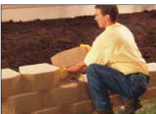
3. Install Additional Courses

Backfill first course units with clean granular fill material (i.e. crushed stone/gravel). DO NOT USE PEA GRAVEL! Compact with hand tamper or appropriate mechanical compactor. Backfill and compact behind each course before installing additional courses.