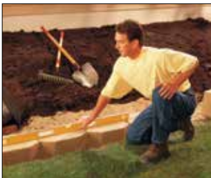
1. Prepare Wall Location

At wall location, dig shallow trench for wall base (see Typical Legacy Stone Section). Place granular leveling pad material. Compact and level the base pad. Place and level the first course units. If grade changes along base of wall, create stepped leveling pad as required. Always start wall at lowest elevation, working to highest. Complete base course before proceeding with additional courses.